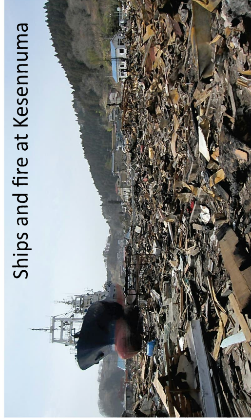
Ships and fire at Kesennuma