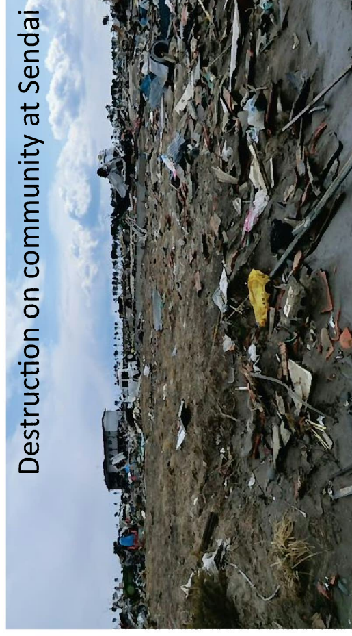
Destruction on community at Sendai